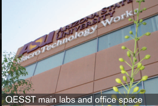
QESST main labs and office space